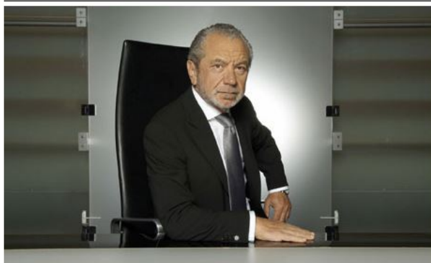
Will you be the next apprentice?